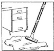
Wet Floor Nozzle