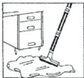
Wet Floor Nozzle