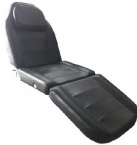
B: 1 x Seat