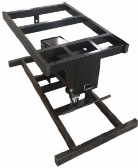
A: 1 x Frame