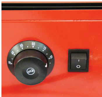
Temperature Control (L) Light Switch (R)