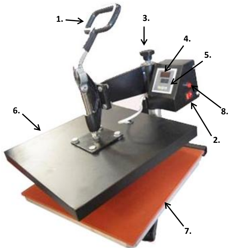
Figure 1: The PixMax™ flat transfer swing components