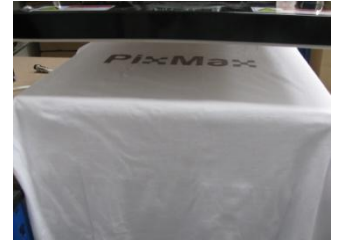
Figure 7: Press released and design removed to reveal finished product.