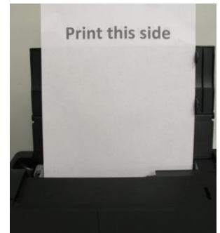
Figure 10: Sublimation paper correct printing side