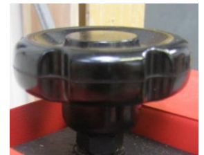
Figure 4: Pressure screw