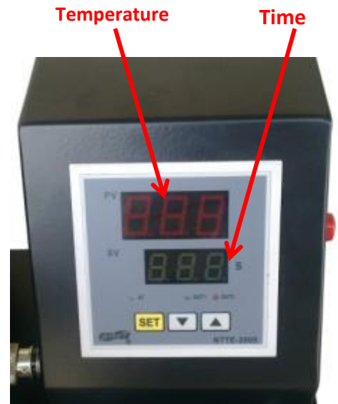
Figure 2: Control box