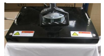
Figure 6: Heat press locked down on product