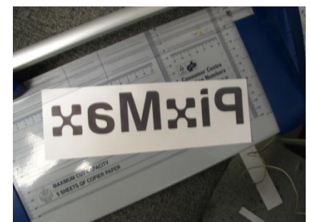
Figure 11: Trim the design