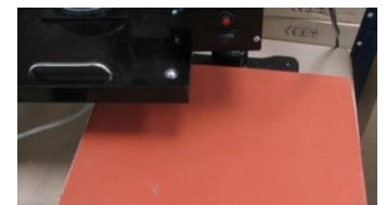
Figure 5: Heat press moved to left side