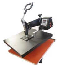
Figure 3: Handle in upright position

Note: Ensure the desired temperature has been reached before pressing.